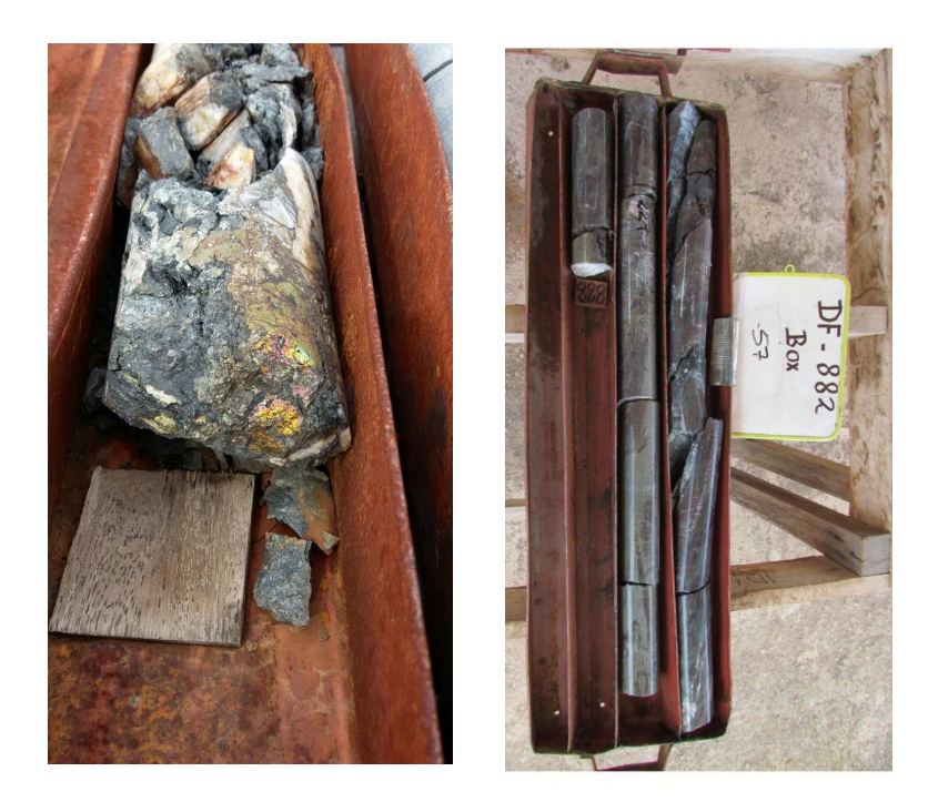
Figure 3: Chalcopyrite and quartz in fault zone at end of Hole DF-565 (left) and Hole DF-882 (right).