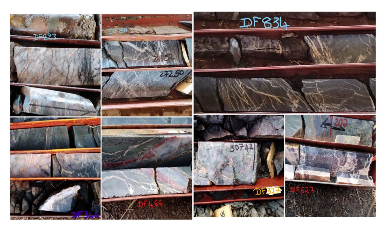
Figure 2: Selections of drill cores from Falea showing the various generation of veining, chloritic alteration and brecciation