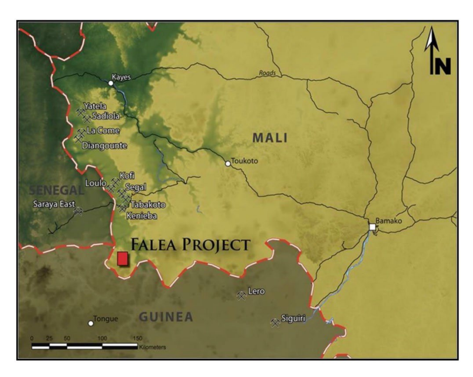
Figure 1. Falea Project in southwest Mali.

project in Senegal (Figure 1). The Falea polymetallic mineralisation contains uranium, copper, and silver that has been defined at or near the unconformity between the Taoudeni basal sediments and the underlying metamorphic rocks of the Birimian aged sequences. Drilling that stopped only a few metres beyond the ore body - but within the Birimian rocks - are shown to contain copper and gold based on assays received to date.